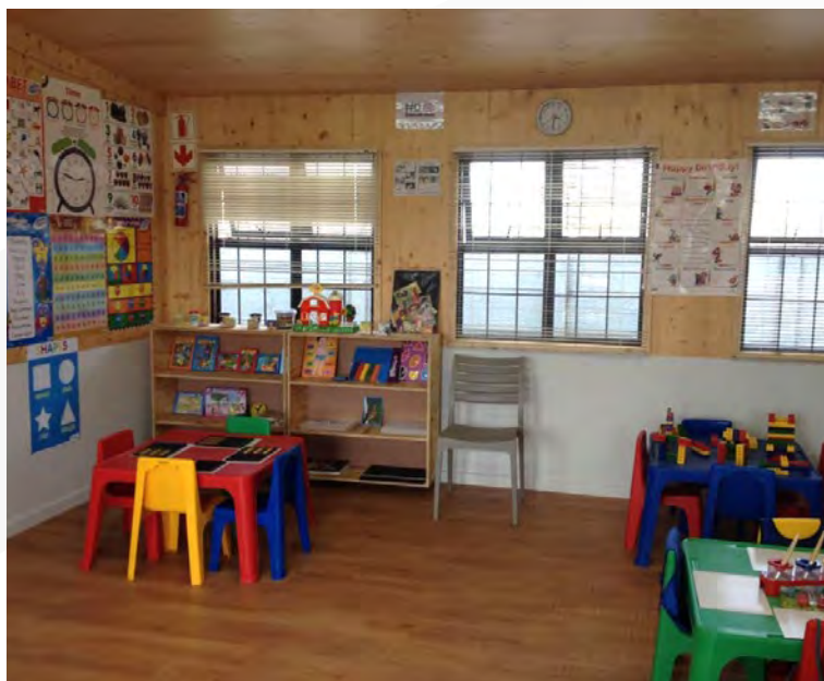
Interior view of the classrooms.