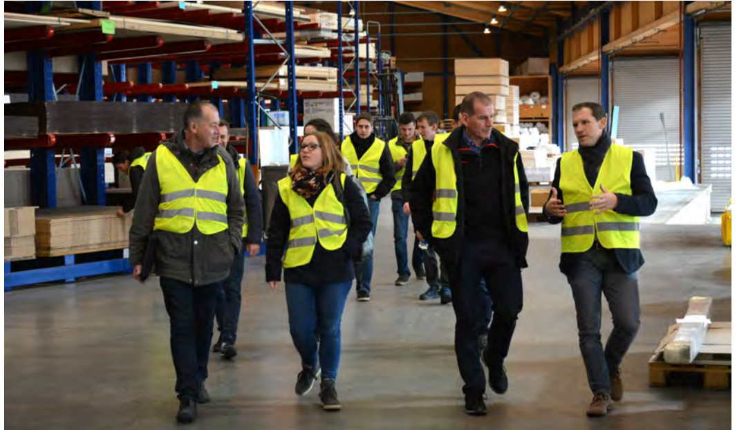
The class of the Bernese Professional College Holz Biel (FH) on the tour through the halls and offices in Niederbipp.

On 18 January 2019 we had the pleasure of welcoming a class of the University of Applied Sciences of Biel (HF Biel) specializing in carpentry/interior design at the KURATLE ACADEMY in Niederbipp. The trained carpenters attend the almost three-year full-time study course at HF Biel to qualify for further functions such as project manager, team leader, work scheduler, etc.