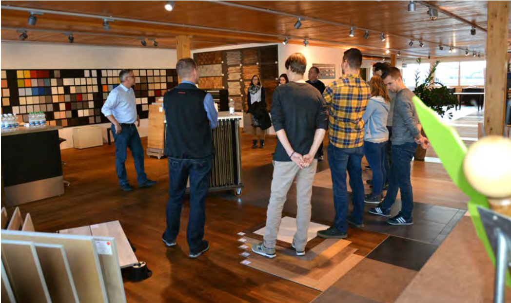
Our products are neatly presented in the KURATLE & JAECKER SHOWROOM.

up-to-date knowledge. In addition to conventional specialist knowledge, students are increasingly interested in topics such as digitization, BIM, industry 4.0 and the like. Many see this as an opportunity to work in an attractive wood technology environment in the future.