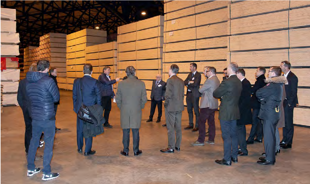
The tour gives the participants an insight into the KURATLE GROUP AG.

Due to the award Entrepreneur of The Year 2018 (EOY), the KURATLE GROUP was chosen for the annual network event this year. And so the members of the EOY Club met on 23 January in Leibstadt.