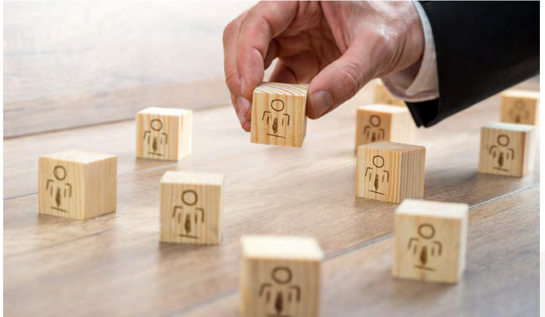
The company is characterized by a family spirit, which is compliant and curious about challenges and in constant development. (Excerpt from the mission statement of the KURATLE GROUP AG)